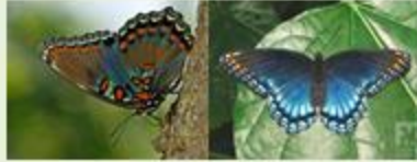
Red Spotted Purple Butterfly