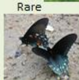
Rare Pipevine swallowtail