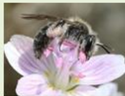
Spring Beauty Mining Bee