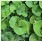
Native Habitat Moist Woodlands